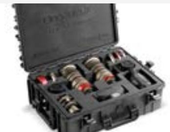
Interchangeable lens mount

The EZ lens series are supplied with a universal lens mount thread, allowing the lenses to be configured to PL, Sony-E, or Canon EF mounts. All lenses are supplied with one PL lens mount ring, and additional lens mount rings can be purchased separately when needed.