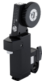
Controlled Lens Motor CLM-4 (Set) K0.60185.0