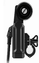
CLM-5 (Basic Set) K2.0006361