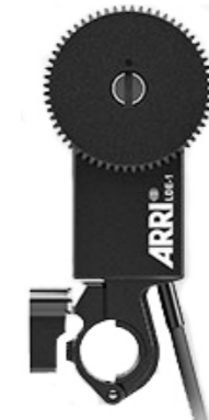
Lens Data Encoder LDE-1, K2.0002680