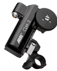
Controlled Lens Motor CLM-3 (Set) K0.60057.0