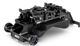
Plate for Canon C500 MkII K2.0033439

Pro Set for Canon C500 MkII KK.0033626 Consists of: K2.0033441 1x Top Plate for Canon C500 MkII K2.0033441 K2.0033439 1x Plate for Canon C500 MkII K2.0033439 K2.0017138 1x Bridge Plate Adapter BPA-5 K2.0017138 K2.0017270 1x Camera Center Handle CCH-4 K2.0017270 K2.0019282 1x Sliding Adapter for CCH-4 K2.0019282 K2.0006186 1x Rod Mounting Bracket RMB-3 K2.0006186 K2.66255.0 1x 15mm Reduction Insert K2.66255.0 K2.0006140 1x Mini Viewfinder Bracket MVB-1 K2.0006140 K2.0015520 1x Bracket for Canon LM-V1 K2.0015520 K2.66252.0 1x Support Rods 340mm, Ø15mm K2.66252.0