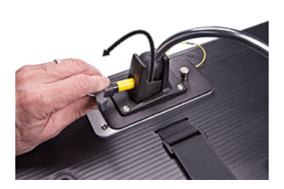
A 180° turn loosens the orientation of the mount. A right turn tightens the mount.

MTP-LBS Kino 41 Lollipop w/ Baby Receiver Short (16mm)