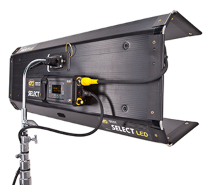
Mounted on a Stand

One of the design features of the Select Fixture is the twist-on removable Center Mount. When it's on, the fixture mounts stand; when it's off, the fixture is flat and can be hand-held, or hidden in a space too small to place a stand-mounting fixture mount is removed, the grommet holes along the edge of the fixture are designed to allow the fixture to be screwed to a wall or ceiling through its eyelets.